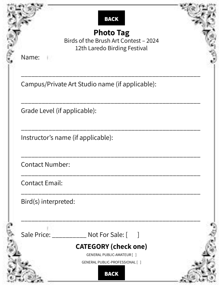
Photo Tag Birds of the Brush Art Contest – 2024 12th Laredo Birding Festival Name: Campus/Private Art Studio name (if applicable): Grade Level (if applicable): Instructor's name (if applicable): Bird(s) interpreted: Sale Price: _______ Not For Sale: [ ] CATEGORY (check one) GENERAL PUBLIC-AMATEUR [ ] GENERAL PUBLIC-PROFESSIONAL [ ]