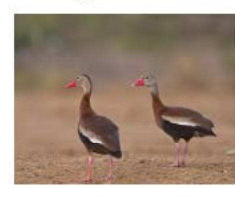
Black-tailed Whistling Duck