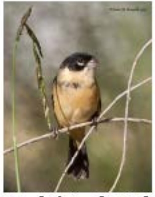
Morelet's Seedeater formerly known as White-collared Seedeater

To view more photos, please visit the Laredo Birding Festival and Monte Mucho Audbon Society Facebook pages, as well as laredobirdingfestival.org, allaboutbirds.org, ebird.org, birdsoftheworld.org, and facebook.com/raul.delaredo1.